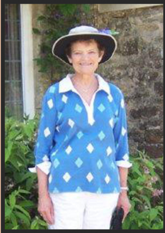
An inveterate Anglophile returns to her former Cotswold cottage home on a British walking tour