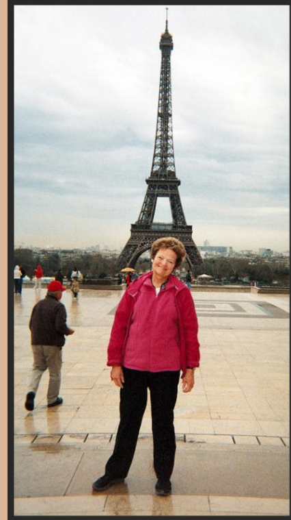
Love these river cruises!