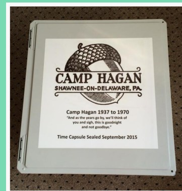
Top View of Hagan Time Capsule

Is there something small you would like to immortalize in the Hagan Time Capsule? It must be small enough to fit in the palm of your hand. It cannot be rubber (like a Hagan swim cap), liquid (like river water) or anything metal (like paper clips). Bring it with you to the reunion and you can put it into the Time Capsule on Thursday morning. The size of the Time Capsule is 19.8 x 18.2 x 10.3 inches.