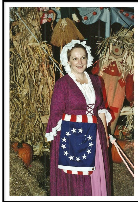
Portraying Betsy Ross

Beginning in 1995, I started to work for companies that plan corporate meetings and events; which has given me the opportunity to travel the world. Sounds a bit glamorous, but the hours are long; sometimes I only see the hotel and/or the convention center where the event is being held. However, there have been some unique experiences; getting clearance from the U.S. Department of State to assist with and/or give tours to US Presidents, foreign dignitaries and heads of state; along with being the "handler" for various entertainers and guest speakers.