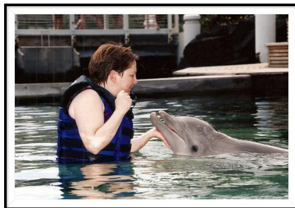
Training the Dolphins on the Big Island of Hawaii

Beginning in 1995, I started to work for companies that plan corporate meetings and events; which has given me the opportunity to travel the world. Sounds a bit glamorous, but the hours are long; sometimes I only see the hotel and/or the convention center where the event is being held. However, there have been some unique experiences; getting clearance from the U.S. Department of State to assist with and/or give tours to US Presidents, foreign dignitaries and heads of state; along with being the "handler" for various entertainers and guest speakers.